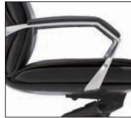
铝合金扶手 Aluminum armrest