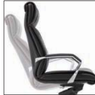
倾仰强度调节/锁定 Tilting tension adjustment and locking