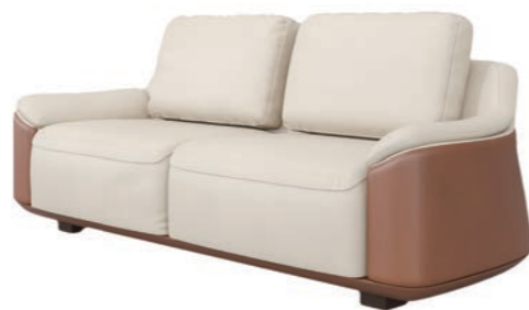
● 三人位 Three seats