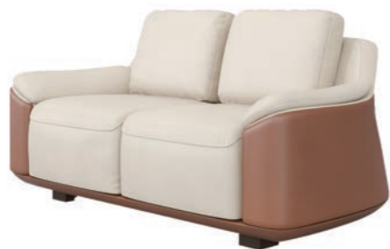
● 双人位 Double seats