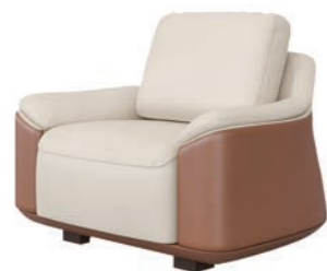
● 单人位 Single seat

The armrest is designed with a 45° bevel, just like open arms, natural supporting your arms. It may also be used as a headrest in the afternoon nap, comfortable and intimate.