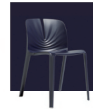
Ink blue (for customization)