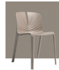
Pinkish grey (for customization)