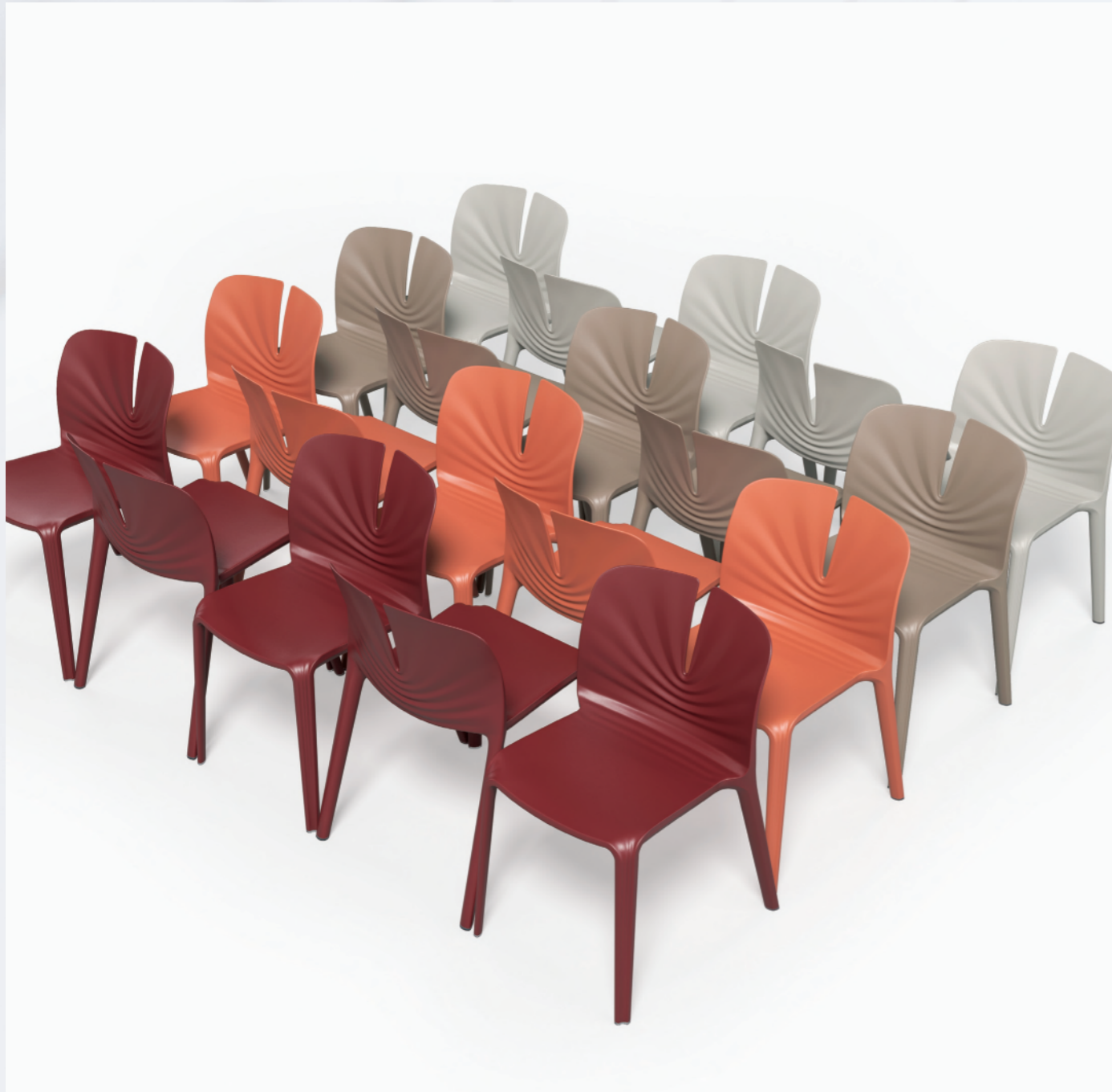
Blooming light and color