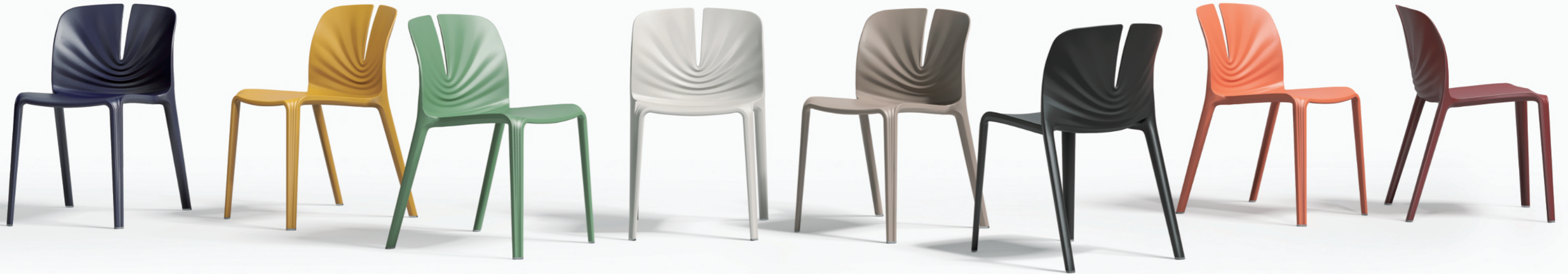
With 8 colors from nature, Plis chairs express tinct delicacy, a treat to your eyes.